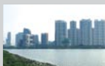
Hengqin Development Zone, Zhuhai