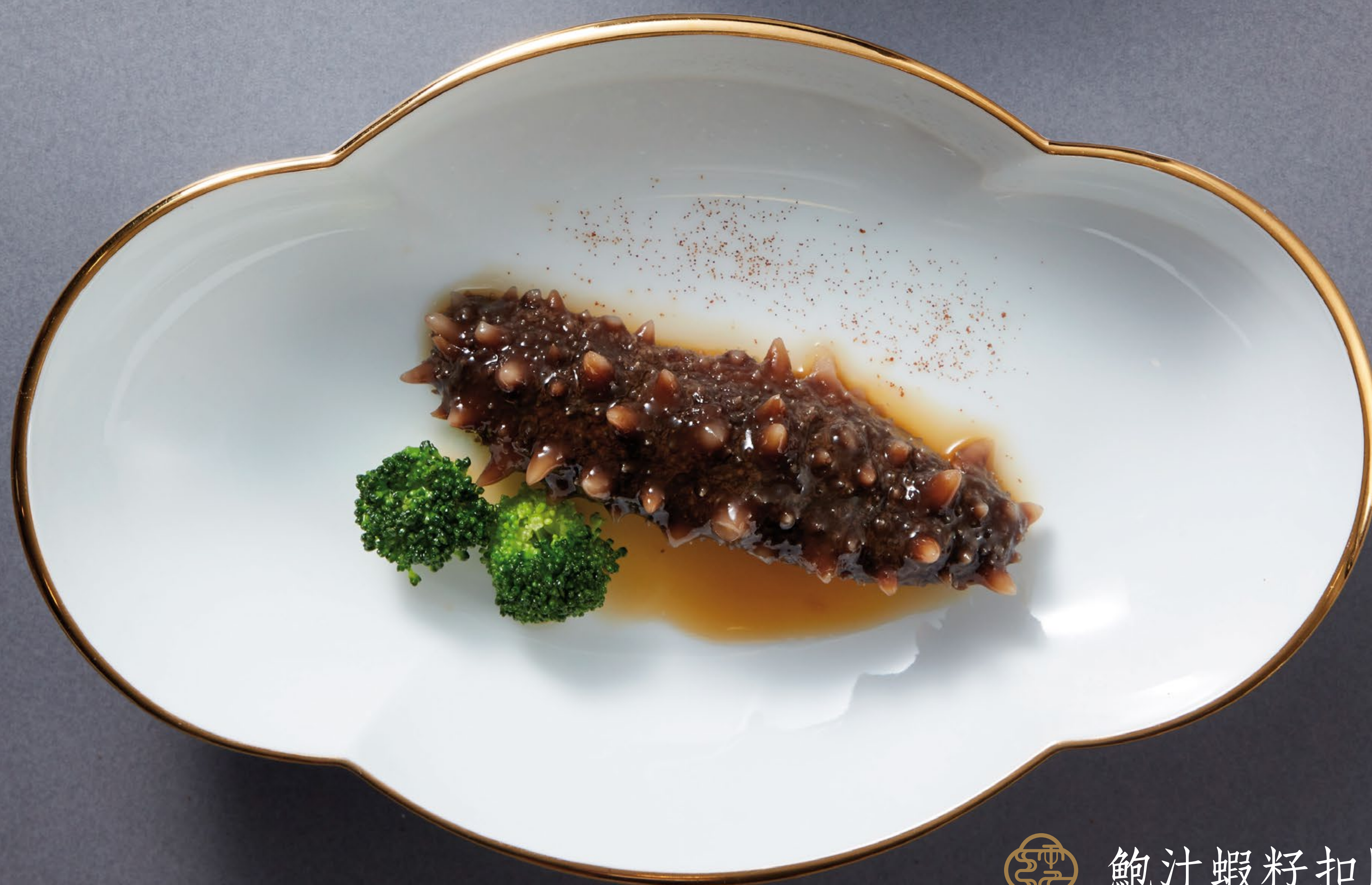
鮑汁蝦籽扣關東遼參 拌翡翠 Braised Sea Cucumber with Dried Shrimp Roe and Seasonal Vegetables in Abalone Sauce