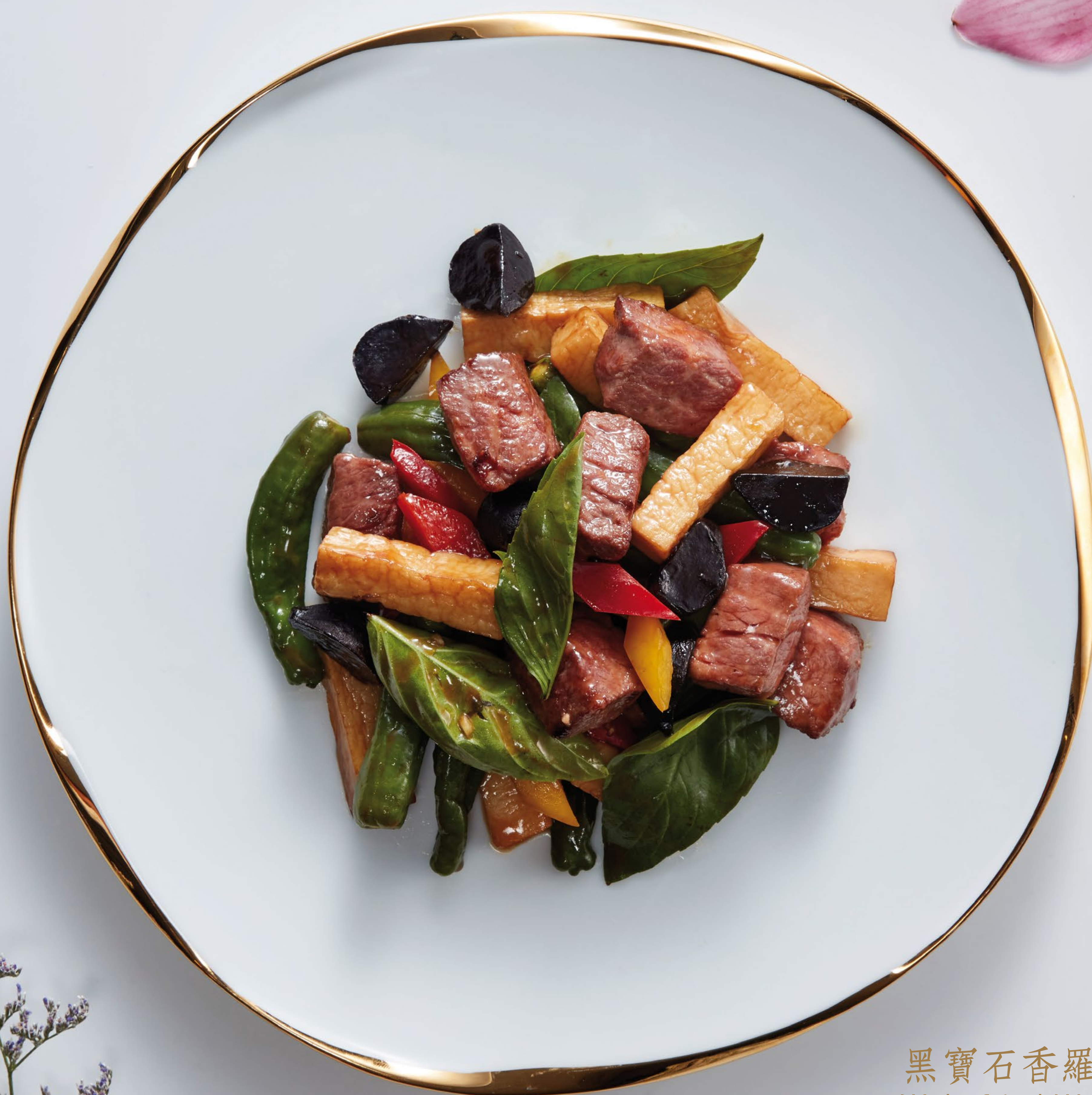
黑寶石香羅葉爆和牛 Wok-fried Wagyu Beef with Black Garlic and Basil