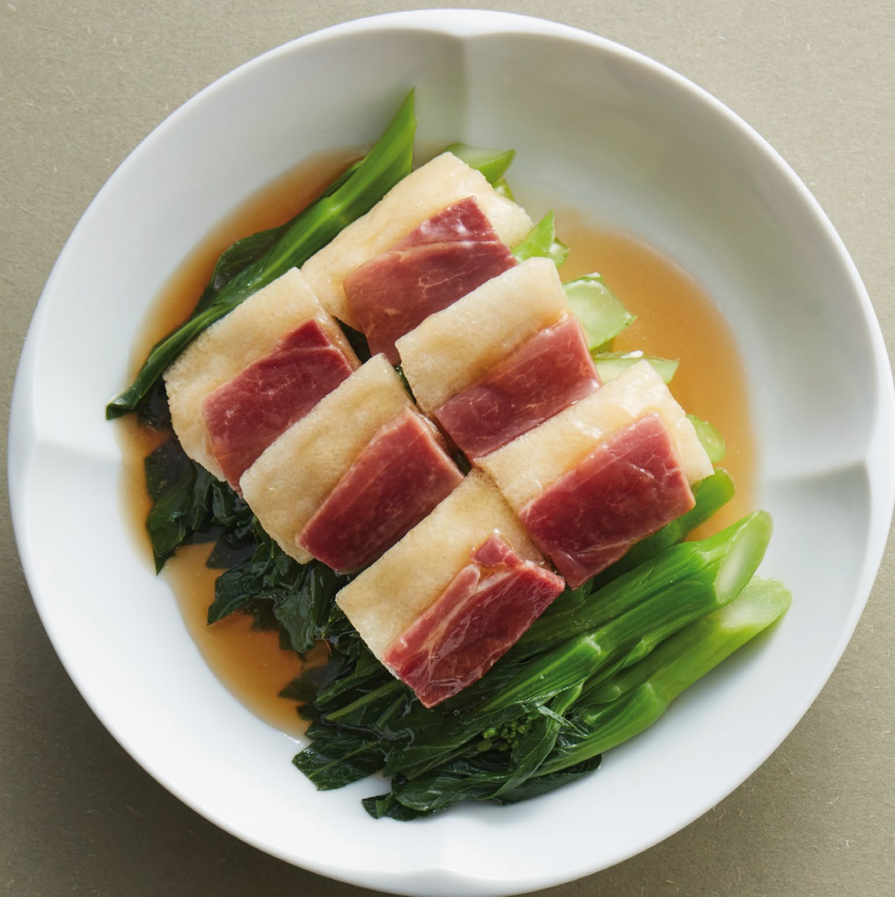
雲腿竹筴扒時蔬 Braised Vegetables with Bamboo Pith and Yunnan Ham